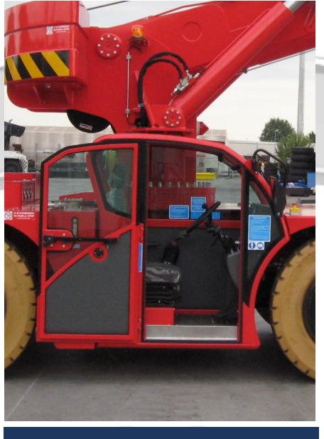
Ergonomic operator cabin