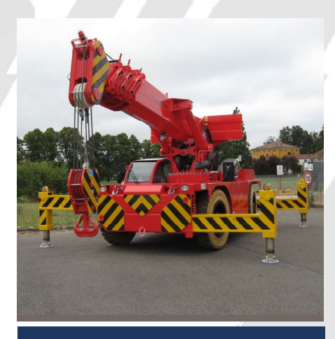
Indipendent crossbars and outriggers