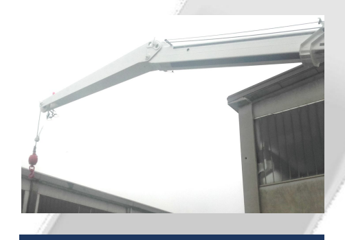
3T Manual Jib