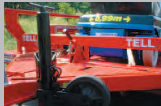
Support wheel with reinforced construction