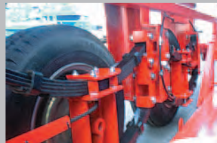
The refined suspension system ensures that the trailer is towed safely and securely.