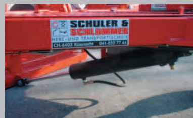
The lift cylinder is protected under the drawbar, and makes direct contact with the platform.