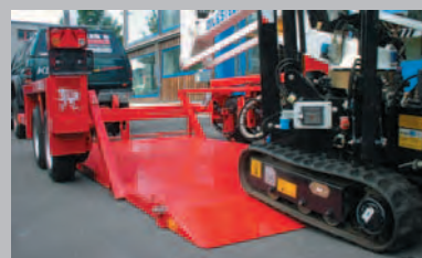
The entire width of the platform serves as the ramp; the flat pitch also makes it possible to drive equipment with minimal ground clearance directly onto the trailer.

See for yourself, how the TELL efant has made a distinguished name for itself.