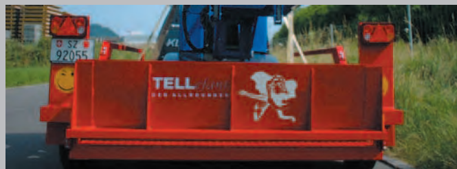
Modified folding ramp provides underride protection