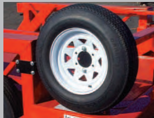
Spare tire with holder