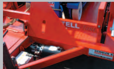
Battery and hydraulic components are integrated with the chassis and are lockable.