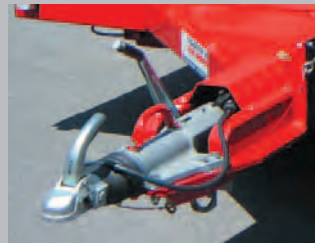
Hydraulic overrun brake