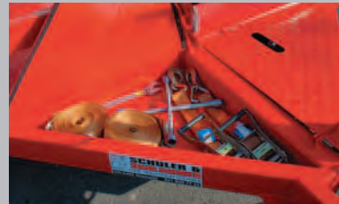
Chassis-integrated, lockable storage compartments.